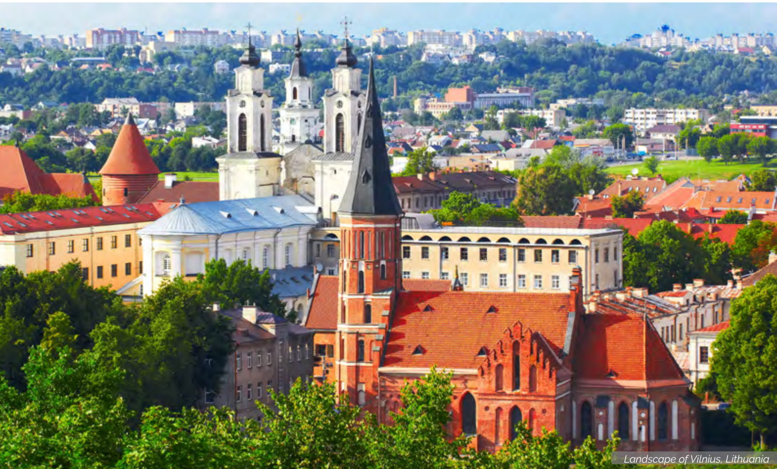
Landscape of Vilnius, Lithuania