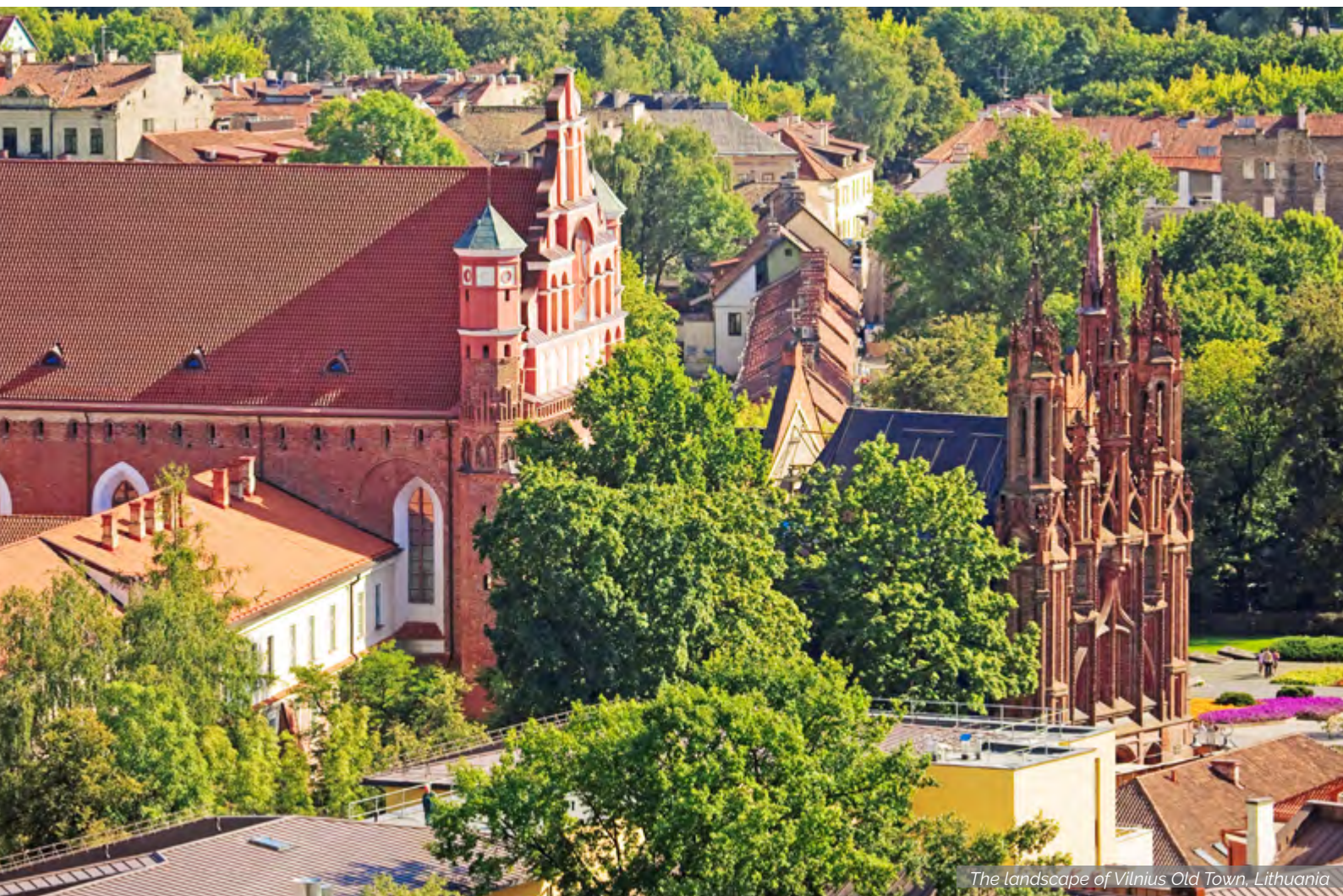
The landscape of Vilnius Old Town, Lithuania

Tour outline: a trip from Vilnius to Riga. On the way visits of the Hill of Crosses in Šiauliai and Rundale Palace in Latvia. Check-in at Hotel Radisson Blu Latvija 4* or similar.