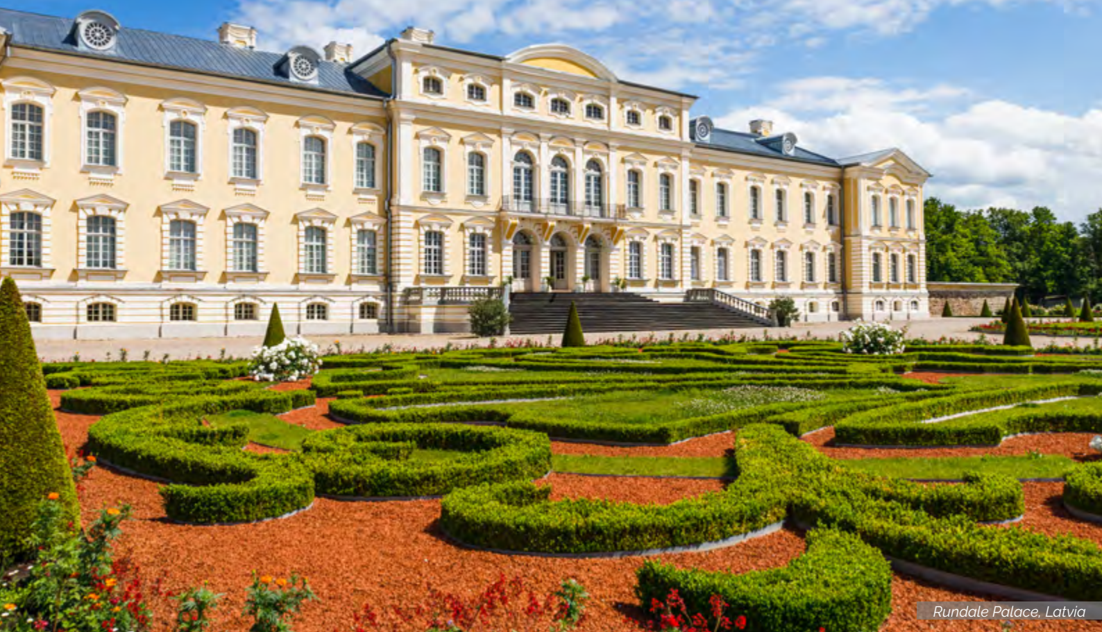
Rundale Palace, Latvia